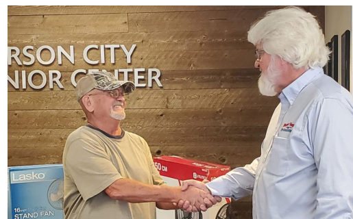
Ropers Heating & Air

Does someone you care about have memory loss? This FREE program for LGBTQ+ adults can help! • Nine coaching sessions for you and the person with memory loss • Complete the virtual program from the comfort of your home • Compensation for completing five phone interviews Call: 1-888-655-6646 | Email: ageIDEA@uw.edu | Visit: ageIDEA.org