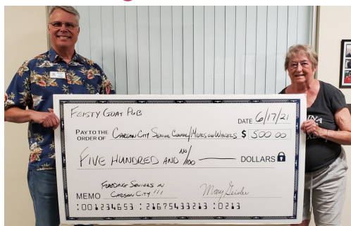
Feisty Goat Pub