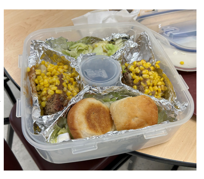
Photo: Buddy Ray who repurposed a storage container by adding dividers to keep the food separate.

If you have feedback about this new service, we want to hear it!