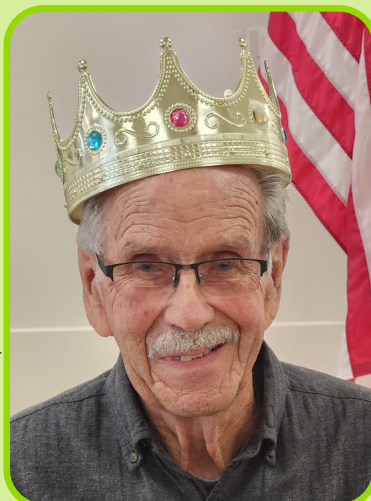
KING Virgil Christenson 91