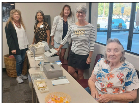
Thank you to the Jewelry Sale team for raising nearly $1,500!

In October we had two impactful fundraisers for Meals on Wheels, lead by an all-volunteer crew! Many thanks to all involved and the hours you donated!