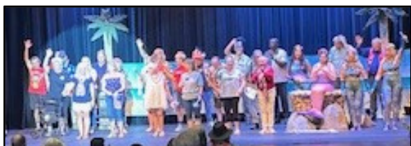
Thank you to Follies for raising over $5,000!